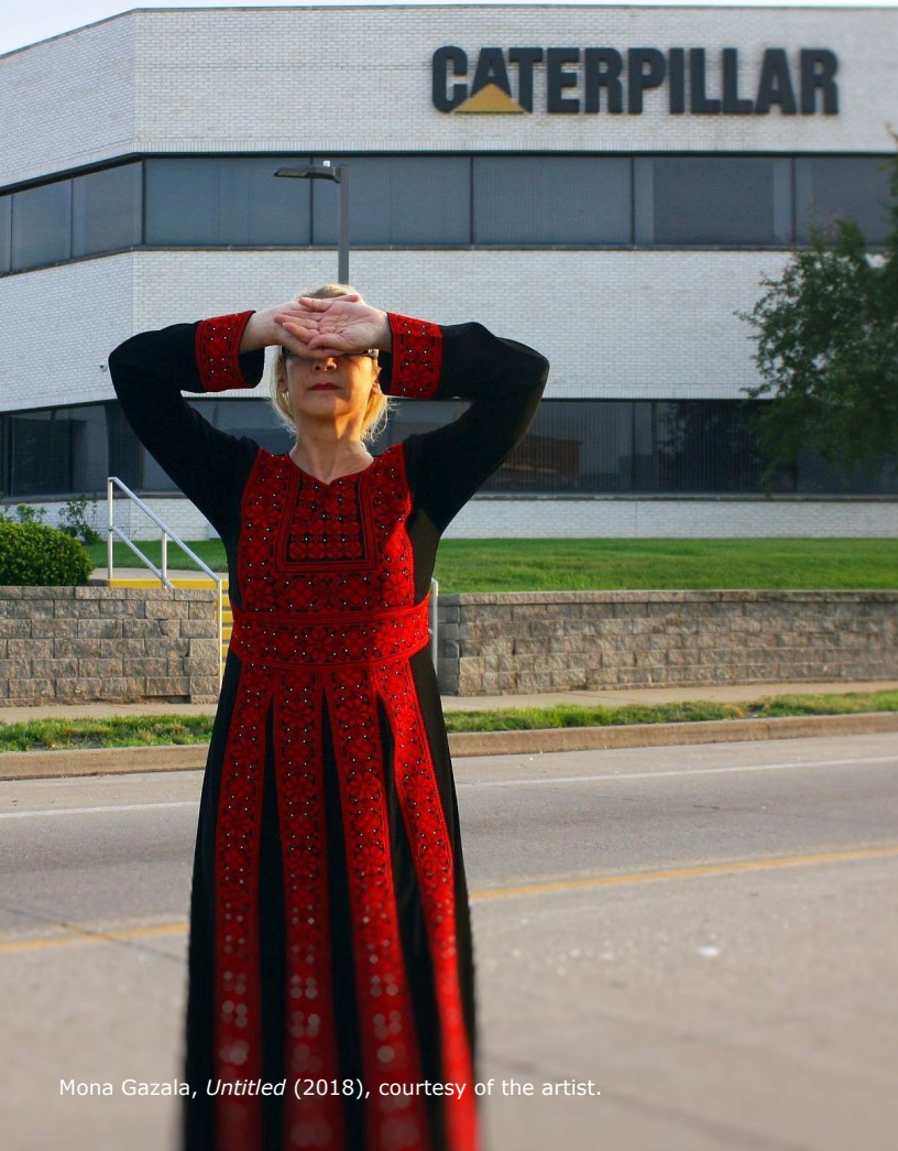
Mona Gazala, Untitled (2018), courtesy of the artist.