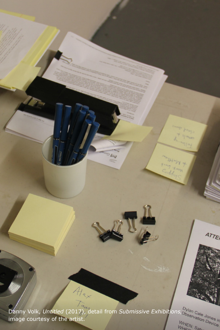
Danny Volk, Untitled (2017), detail from Submissive Exhibitions , image courtesy of the artist.